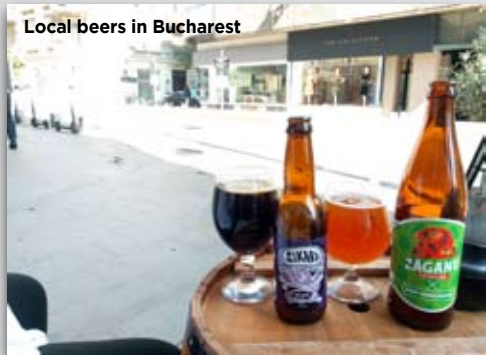
Local beers in Bucharest

Bucharest. There are no fewer than 15 permanent breweries here (not quite Sheffield standard, but not a bad effort!), as well as a handful of gypsy brewers. Romania's biggest craft brewery, Hop Hooligans, are technically based just outside the city limits, but they dominate the Bucharest beer scene – not a bad thing as they are generally excellent. One of the biggest selections of their offerings was at Zeppelin Pub , a British-style bar with a (possibly overly) friendly resident cat.