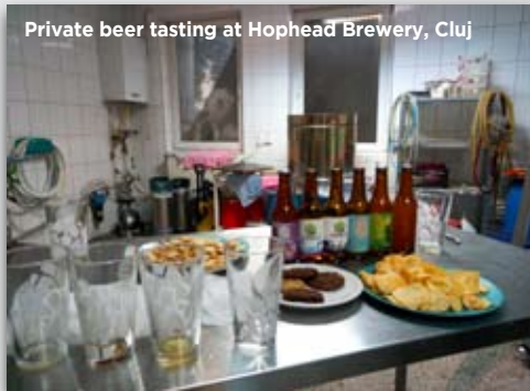
Private beer tasting at Hophead Brewery, Cluj