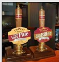
Chantry Brewery Real Ales

One of only three pubs set in consecrated grounds