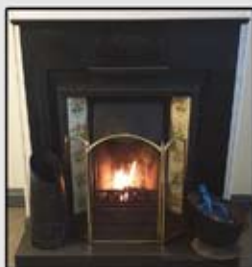
Two Real Fires & Dog Friendly