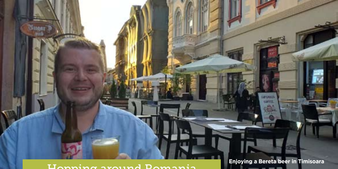
Enjoying a Bereta beer in Timisoara