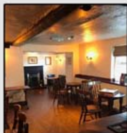
Restored Original Features